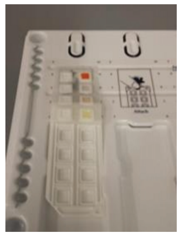
Figure 2. The T.R.U.E. TEST prepared for application.

The study was performed in a group of 20 volunteers over a period of 6 weeks. Each participant received one of two creams, one with resveratrol or the other with the same base but without resveratrol (placebo cream). The volunteers tested cosmetic products, applying them on the face twice a day, in the morning and in the evening. Prior to the tests, the skin of the probands was examined in order to diagnose its condition (set as the zero state). Then, subsequent digital measurements were made every 2 weeks. Physical studies were conducted using the Courage+Khazaka Multi Skin Test Center® MC 1000 device. The hydration of the epidermis was evaluated with a corneometer which measures the hydration level of the superficial layers of the skin (stratum corneum), based on electrical conductivity. The higher the