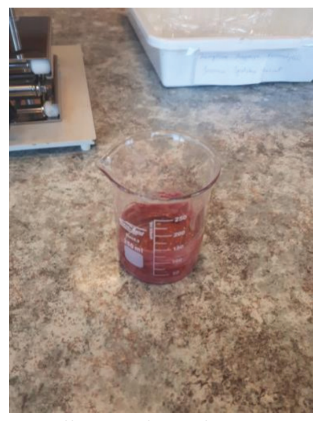
Figure 3. Cold O/W cream with resveratrol.

All the volunteers were asked to complete a questionnaire, which addressed their knowledge of the tested ingredient, their age, their awareness of complexion type they had and their possible allergic reactions. They were also asked to sign an informed consent to participate in the experiment. Before the test, an interview was conducted with each proband where the principles of product testing and the possible side effects were explained. This research was conducted with the permission of the Poznań Medical University Bioethical Commission. The volunteers received written instructions for using the cosmetic. During the tests, they could not use other cosmetics or a beautician's services. Thanks to the sensory evaluation, qualitative analysis and subjective assessment of the tested cosmetic, we were able to learn the opinion of potential consumers (Dębowska, 2010).