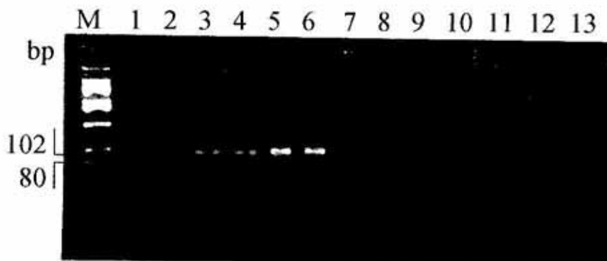
Figure 2. Electrophoresis on 4% agarose gel of PCR products using crude P. borealis DNA as a template and tRNA Leu primers.

also increase the specificity of amplification; 1 mM spermidine in the PCR reaction mixture suppressed the amplification of unspecific PCR products of apolipoprotein B-100 gene, and led to a single product of the expected size (R.D. Plewa, personal communi-