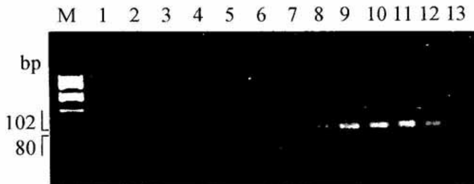
Figure 1. Electrophoresis on 4% agarose gel of PCR products using crude P. borealis DNA as a template and tRNA Leu primers.

hornwort ( A. crispulus ) and liverwort ( P. borealis ) DNA template has a similar or even the same origin. Many publications indicate that polyphenols, polysaccharides and terpenoids are the main factors that inhibit PCR carried out with plant total DNA template [1, 3, 4, 6]. In order to overcome this problem we tested the effect of twelve polyamines at different concentrations on the crude template from P. borealis . We have found that 0.3 mM concentration of tri- or tetramines (2,3-tri, 3,3-tri, spermidine, 3,3,3-tet and spermine) suppressed the PCR inhibitory effect (Fig. 2, lanes 2–6), the only exception being the triamine 2,2-tri (Fig. 2, lane 1). In PCR samples where tri- or tetramines (except 2,2-tri) were added we obtained a product of the expected size of about 90-bp, which indicates amplification of liverwort tRNA Leu genes. The same experiment was carried out with 1 mM polyamine concentration. In this case the efficiency of PCR was even higher. We have obtained the product of expected size