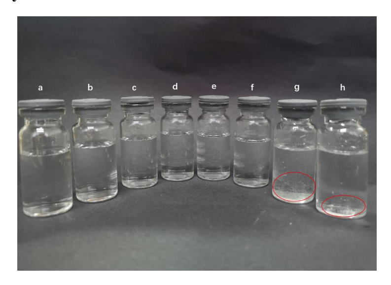
Figure S1. Optical image of the dissolution of ART.

a) 0.031 mg/mL ART-12%PEG4000; b) 0.063 mg/mL ART-12%PEG4000; c) 0.125 mg/mL ART-12%PEG4000; d) 0.248 mg/mL ART-12%PEG4000; e) 0.496 mg/mL ART-12%PEG4000; f) 0.982 mg/mL ART-12%PEG4000; g) ART-12%PEG4000 prepared with a target concentration of 2 mg/mL; h) ART aqueous solution prepared with a target concentration of 1 mg/mL.