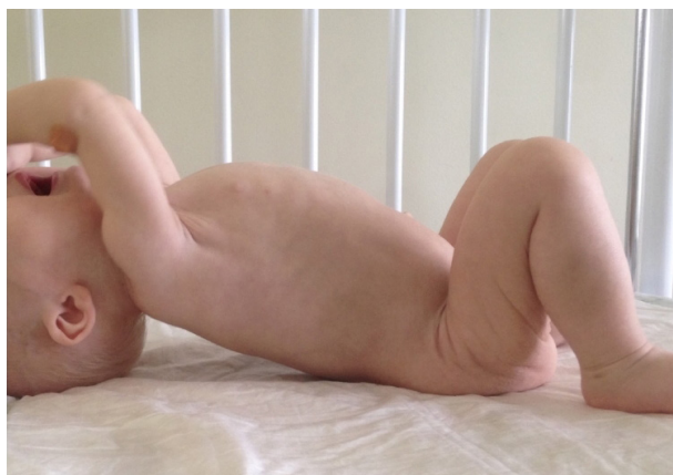
Figure 2. Examination revealed a characteristic retroflexion of the neck.

Based on those clinical and biochemical features, Gaucher disease was suspected. The results were as following: decreased activity of leukocyte β-glucocerebrosidase (<1.0 µmol/l/h (reference \geq 4.1 µmol/l/h)), increased activity of chitotriosidase (14300 nmol/ml/h (reference 10–150 nmol/ml/h)), increased level of lysoGb1 (775 ng/ml (reference \leq 6.8 ng/ml)). The patient was found to be a compound heterozygote for two known