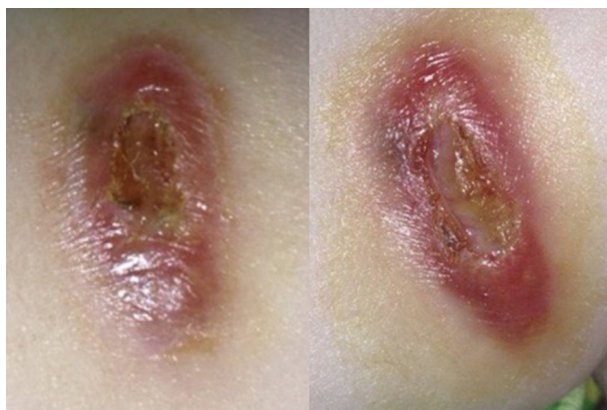
Figure 1. An ulceration in the upper arm at the BCG vaccine injection site.

At the age of 6 months, the infant's weight and length were below the 3rd percentile. A progressive developmental delay accompanied by the opisthotonus, strabismus, and hepatosplenomegaly were observed.